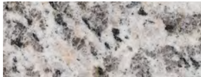
904 Tiger Skin White