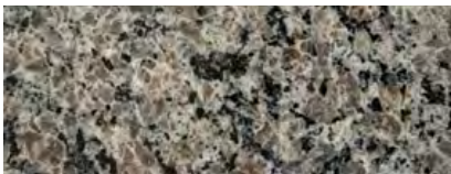
9603 Rio Roca