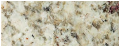
9602 Luna Bai